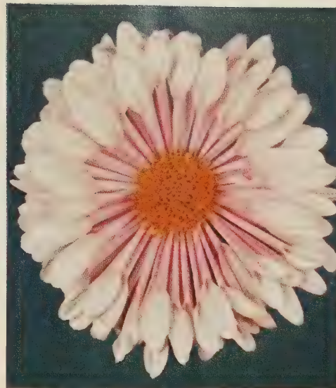
BLUSHWHITE. 60c each; 3 for $1.50